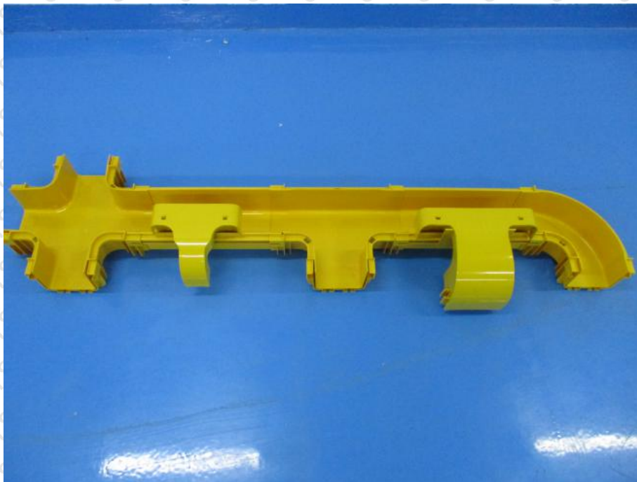
图 1 试验前